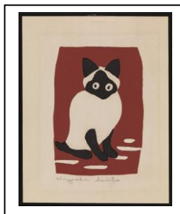
Kiyoshi Saito, "Cat," woodblock print, ink and color on paper, 1954.

Serigraph - is also called silkscreen and screen-printing. It's a technique that pushes ink through a woven mesh screen (at one time it was silk). The stencil fixed into the screen is what transfers onto a surface: paper, metal, wood, plastic, or fabric.