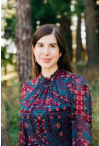
Simon & Schuster.

Please make plans to join us on Thursday, October 26 at 12:00pm for our discussion of The Ballad of Laurel Springs . You can find us on the dial at 100.1 FM, streaming live on Radio Bristol , or via the Radio Bristol app. The book is available at the Bristol Public Library, so be sure to pick up a copy and read it ahead of time. The librarians will be happy to help you find it! We look forward to exploring this book on-air, and if you have thoughts or questions about the book that you would like to share with our readers, you can email info@birthplaceofcountrymusic.org (Subject line: Radio Bristol Book Club) – your book insights might appear on air with us!