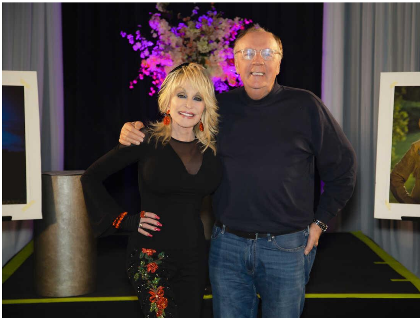
Image from NPR author interview “Dreams do still come true’ in a new novel by Dolly Parton and James Patterson”

Dolly Parton is one of the most revered and honored female country music singer-songwriter of all time. Born in Tennessee, she began singing and performing at an early age. She has 44 career top 10 country albums, has had 25 singles at no.1 on Billboard country music charts, received 11 Grammy awards and 50 nominations, and is one of only seven women to have won Country Music Association's Entertainer of the Year Award. In 1999 she was inducted into the Country Music Hall of Fame and in 2022 was inducted into the Rock and Roll Hall of Fame.